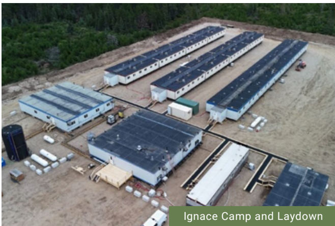
Ignace Camp and Laydown