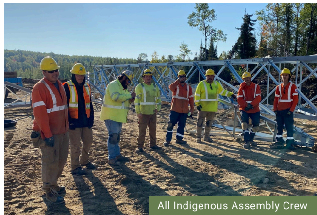
All Indigenous Assembly Crew

Construction at Ignace Camp is complete, and workers began staying on-site in mid-September. Prior to the opening, Wabigoon Lake Ojibway Nation Elder Kathy McIvor visited the camp to bless the buildings. The assembly crews hard work has led into Phase 1 tower erection scheduled for October 6th.